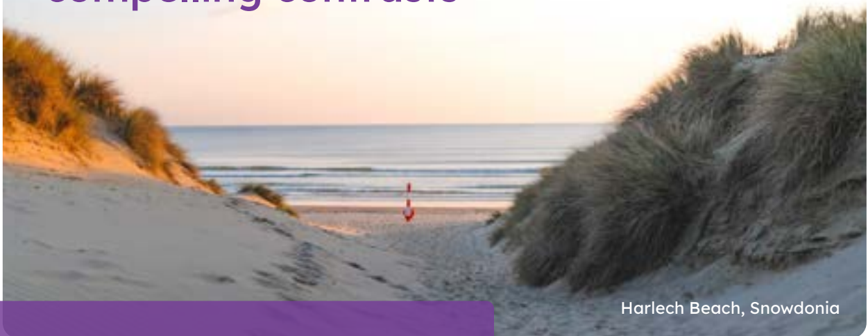
Harlech Beach, Snowdonia

Compact but diverse, Wales is a country where picturesque communities, unspoilt coastlines, stunning countryside and vibrant cities combine to offer you all the relaxation and family adventure you need.