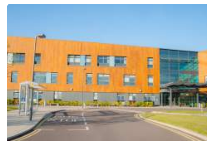
Keir Hardie Health Park