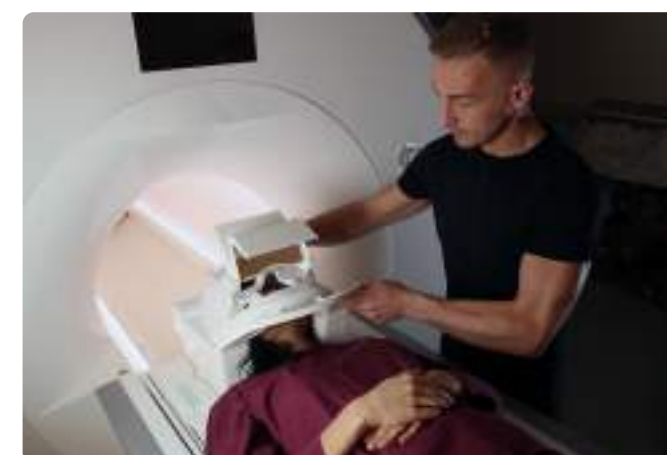
Cardiff University Brain Research Imaging Centre