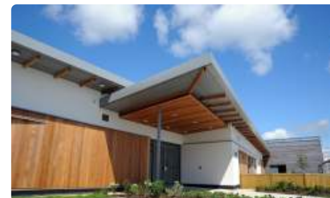
Cefn Coed Hospital, Swansea