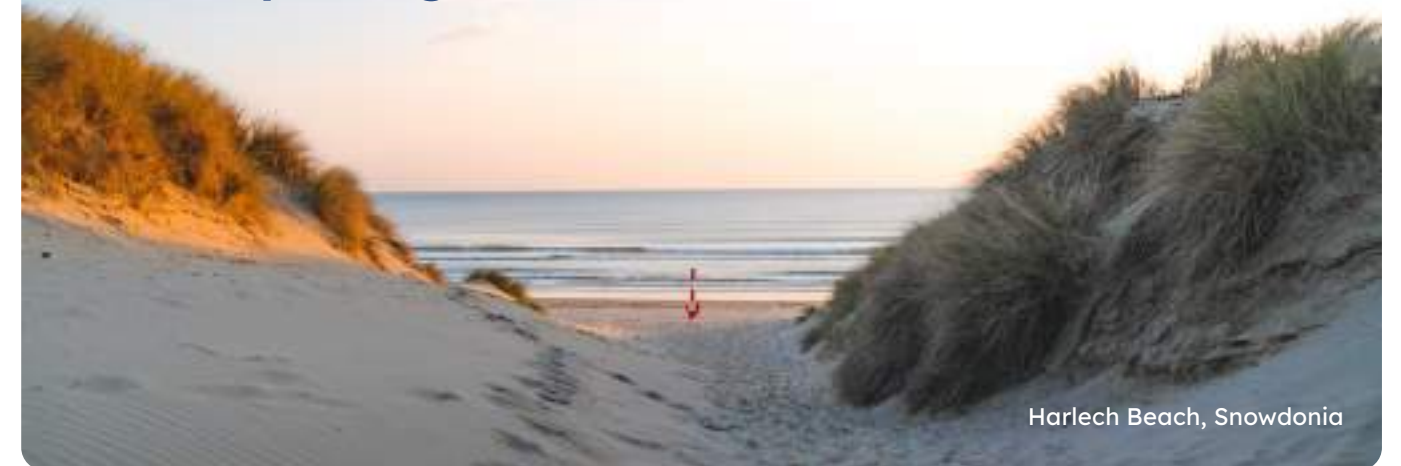
Harlech Beach, Snowdonia